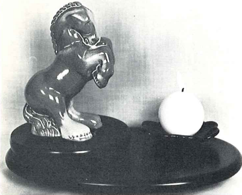
RARING CLYDESDALE by Joseph R. Taylor — #107 — 7" Tall — 5.00