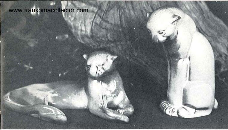
These are designed as a pair for they compliment each other. Seated Puma by Joseph R. Taylor — #114 — 7" Tall — 3.50 Reclining Puma by Joseph R. Taylor — #116 — 9" Long — 6.50