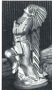
INDIAN CHIEF: A proud dancing warrior: by Ray Murray — #142 — 8" Tall — 3.50