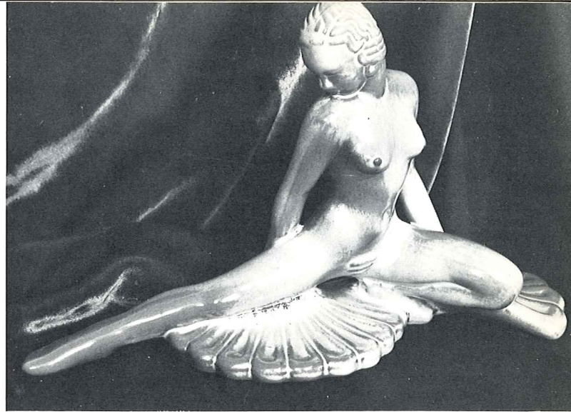
One of the few pieces sculptured after the famous Fan Dancers. It traveled the National Museum Circuit as part of the annual Ceramic Sculpture Show. The Fan Dancer by Joseph R. Taylor — #113 — 8½" x 13½" — 12.50.