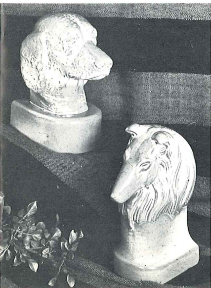
RED IRISH SETTER: A National Prize Winner by Craig Shephard — #120 — 6½" Tall — each 5.00